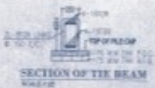
SECTION OF THE BEAM